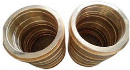
All Copper Tile