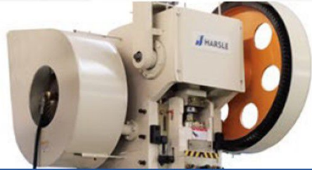
Forged Steel Gear